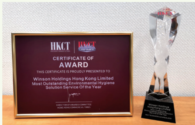
The Group received the award of the "Most Outstanding Environmental Hygiene Solution Service Of the Year" on 20 April 2023. 本集團於2023年4月20日獲頒「年度最傑出環境衛生方案服務」獎。

本集團亦致力於保護客戶的健康及安全。例如本公司一間提供蟲害管理服務的附屬公司—威信專業滅蟲有限公司，須使用根據《除害劑條例》登記的除害劑。此乃經考慮公眾健康及環境保護的基本原則後進行害蟲消滅。於本年度，在選擇第三方服務商時，本集團致力優先委任實施有效安全管理體系及遵守職業安全健康局嚴格安全規定的企業。於本年度，本集團榮獲香港商業時報頒發「年度最傑出環境衛生方案服務」獎，以表本集團於2023年在環境衛生領域的傑出成就。